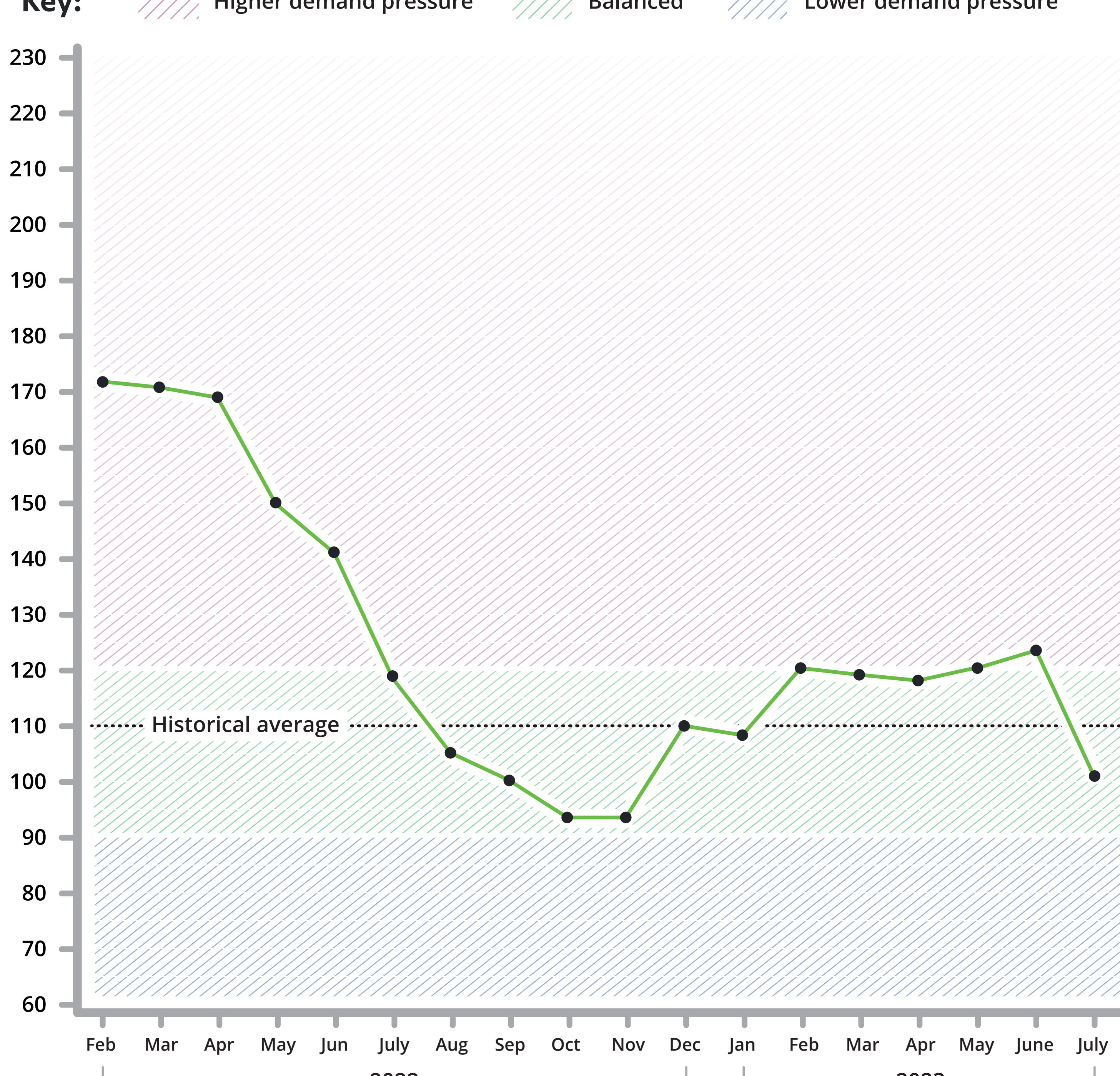
Index Version 1.4

Our Trade Demand Index aggregates a variety of Builderscrack data-points into a representative measure of demand on the trades sector.